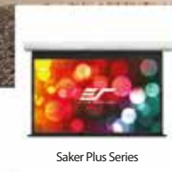
Saker Plus Series