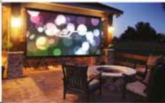
Outdoor Movie Yard Master 2 Series