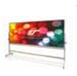
Whiteboard accessories & more