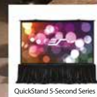
QuickStand 5-Second Series