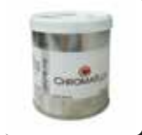
ChromaFlux Projection Screen Paint