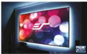
Home media room Aeon EDGE FREE® Series