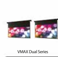
VMAX Dual Series