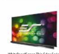
WhiteBoardScreen Thin Edge Series