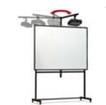
Whiteboard accessories & more