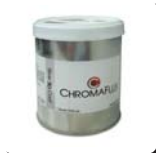
ChromaFlux Projection Screen Paint