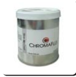
ChromaFlux Projection Screen Paint