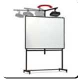
Whiteboard accessories & more