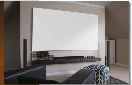
Sleek EDGE FREE® Design