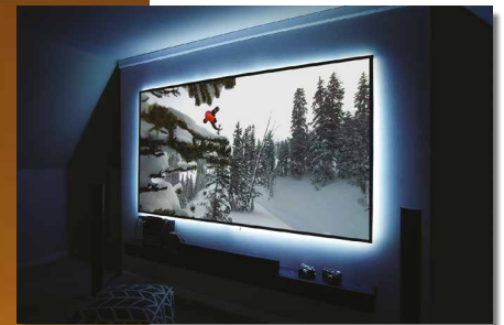
Optional LED backlight kit

The Aeon Series is a fixed frame projection screen that uses Elite's EDGE FREE® technology. EDGE FREE® means that there is no external framework (edge) bordering the material as seen in traditional frame-screens. The design utilizes an internal frame with wrap-around material that resembles a giant size flat panel display. The Aeon includes a black velvet trim edge strip as an option to further enhance the overall appearance.