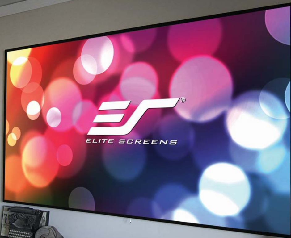
(Shown here on Aeon EDGE FREE® Screen)

The CineGrey 3D is a reference quality front projection screen material formulated for environments with minimal control over room lighting. It was designed to enhance picture brightness, offer accurate color fidelity, and improve contrast levels. The CineGrey 3D is best for family rooms, educational facilities, conference rooms or any applications in which incident light is a factor. Typical matte white surfaces wash out the images when ambient light cannot be controlled. The CineGrey 3D is the best choice for having a projected image with a balanced color temperature and contrast under such conditions. It provides flat spectral response for an accurate color balance in dark room environments as well for reference quality applications. The CineGrey 3D is ready for the next-generation of high-performance video.