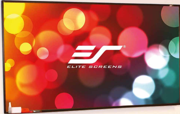
Shown here on WhiteBoardScreen™ Series

Elite's VersaWhite material performs as versatile as a Matte White screen material with the addition of being a dry-erase surface as well. The surface is coated with a transparent dry-erase layer for use as a white board while keeping uniform diffusion and enhancing true color rendition.