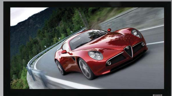
(shown here with Elite PrimeVision)

Elite's PowerGain is perfect for environments where total ambient light control cannot be attained. This is an angular reflective material that provides crisp color reproduction, black & white contrast and resists hot spotting in the presence of ambient light. The textured pearlescent material has black-backing to avoid light penetration and is safely washable with mild soap and water. *Manufacturer's tip: Use a high resolution-low output DLP projector for the best results with this material.