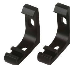
Standard Wall/Ceiling Brackets