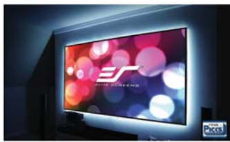
Home media room Aeon EDGE FREE® Series