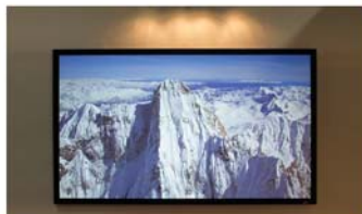
Church Kestrel Stage Series