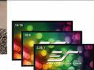
Sable Frame 2 Series