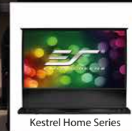
Kestrel Home Series