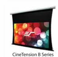
CineTension B Series