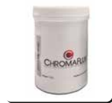
ChromaFlux Projection Screen Paint