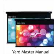
Yard Master Manual