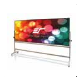
Whiteboard accessories & more