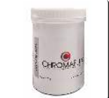
ChromaFlux Projection Screen Paint