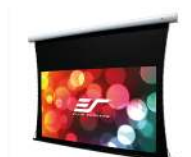
CineTension B Series