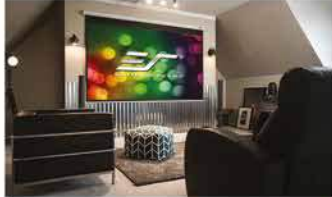
Home Media Room Manual B Series