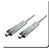
Extension Legs, Accessories & more

Elite Screens Inc. is a US based company with its world headquarters in California and satellite offices in Texas, Georgia, Maryland, Germany, Taiwan, China, Japan, India, and Australia. Elite is an ISO9001:2015 certified manufacturer that specializes in producing retail, commercial and home-theater projection screens for the specific needs of these three sales channels. As a leading American screen company, Elite delivers its promise of award winning quality through cost effective products for today's discerning video enthusiasts. We produce a variety of front, rear ALR, and acoustically transparent projection screen materials for virtually any projection environment.