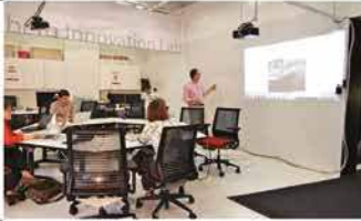
USC Annenberg Lab Insta-DE Series