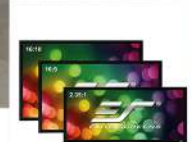
Sable Frame 2 Series