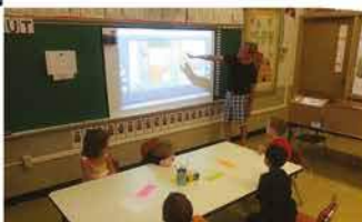
Classroom / Ohio, USA Insta-DE Series