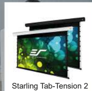
Starling Tab-Tension 2