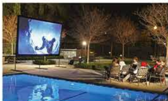
Outdoor Movie Yard Master Series