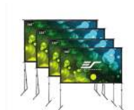
Yard Master Plus Series