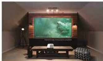
Home Media Room Aeon CLR® Series Ceiling Light Rejecting