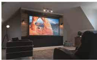
Home media room Starling Tab-Tension 2 Series featuring its CineGrey 5D® material