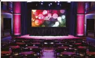
Ballroom Large Venue Presentation QuickStand 5-Second Series