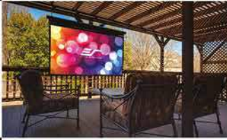
Outdoor Movie Yard Master Manual Series