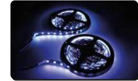
LED Kit, Accessories & more