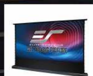
Kestrel Tab-Tension 3