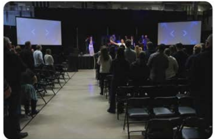
- Sun City Church in Spokane, WA

Many mobile congregations are completely on their own in trying to determine what products are best suited to their specific needs. There are many affordable projectors with high-end performance to choose from and they are all over the internet. However, most individuals know little about what projection screen to use with their projectors. The ideal screen for the mobile church should be portable.