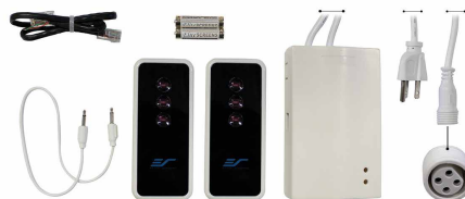
OPTIONAL REMOTE CONTROL KIT FOR WIRELESS OPERATION