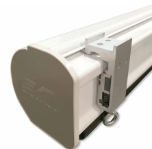
FLUSH WALL/ CEILING INSTALLATION BRACKET