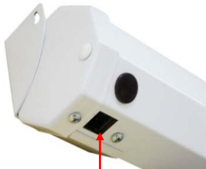
RJ-45 port on electric screen