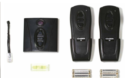
Full control kit: IR/RF remotes, 3-way wall switch