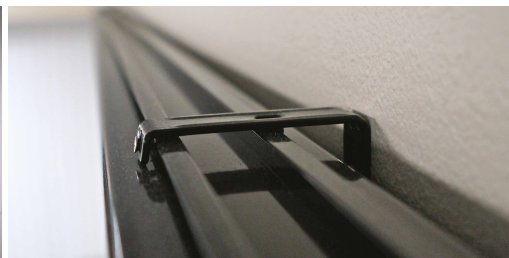
Slideable wall mount brackets included