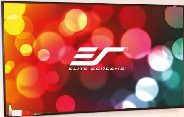
Shown here on WhiteBoardScreen™ Series

Elite's VersaWhite material performs as versatile as a Matte White screen material with the addition of being a dry-erase surface as well. The surface is coated with a transparent dry-erase layer for use as a white board while keeping uniform diffusion and enhancing true color rendition.