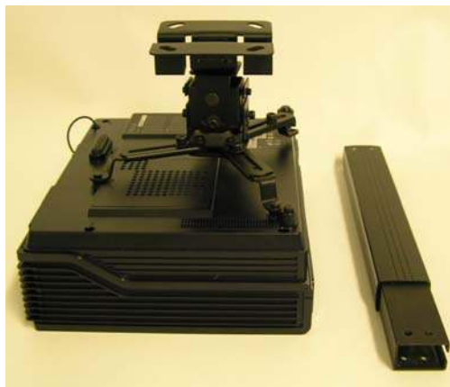
Example of A56-E25B with out extension bar for a flush mount to the ceiling.