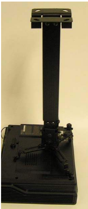
Example of A56-E25B with extension bar for high or angled ceilings.

The A56-E25B Projector mount is 90% compatible with most projector designs. It is easy to use for ceiling projector installations. It includes standard screw hardware for the projector. It can be adjusted in both length and height to optimize the right level of projection. The extension bar can also be removed for low ceiling installation, please see example #1.