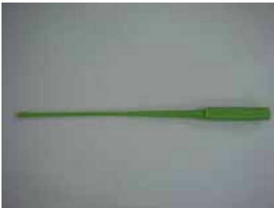
5/32" Allen wrench