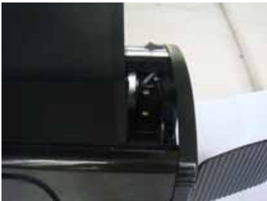
UP adjustment switch