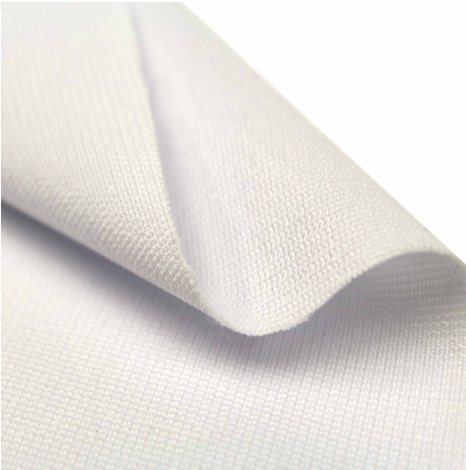
(AcousticPro1080P3 shown here)

Designer Cut Series is Elite's selection of pre-cut projection screen material swatches. The swatches are prepared for use in custom solutions and other improvised installations according to the integrator's needs.